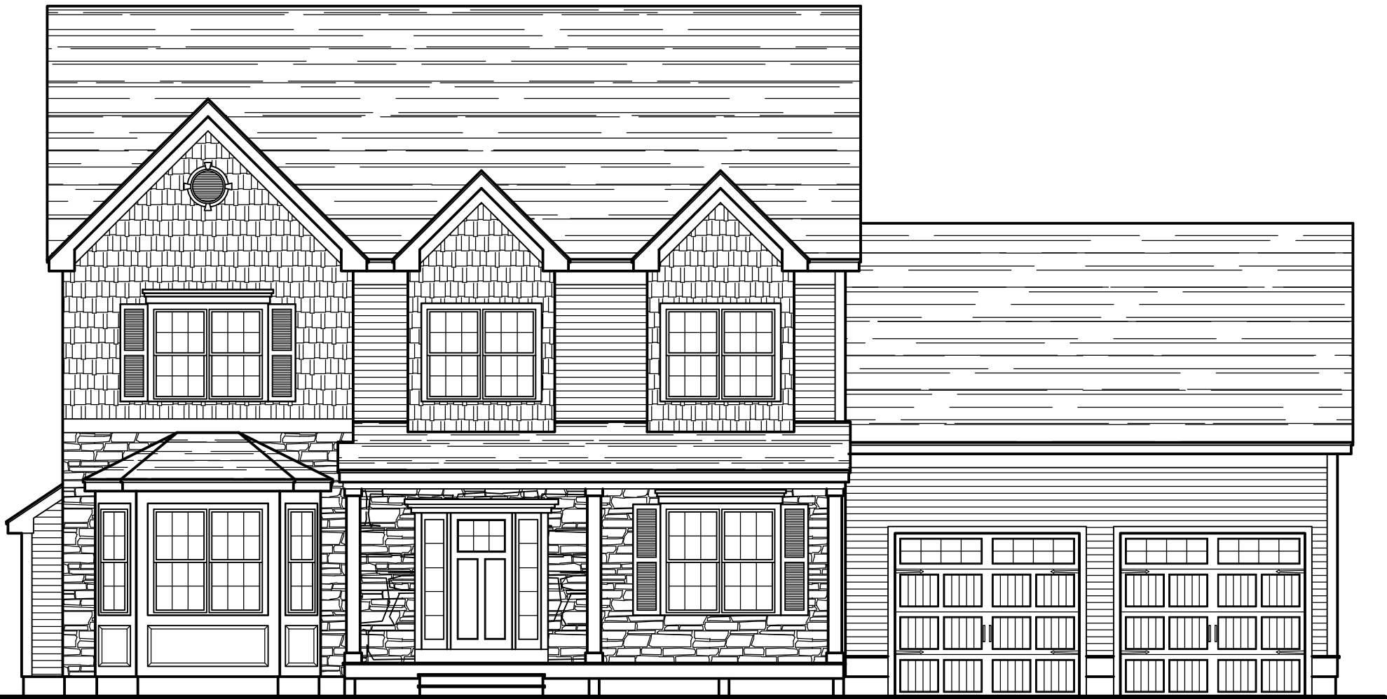
○ FRONT ELEVATION