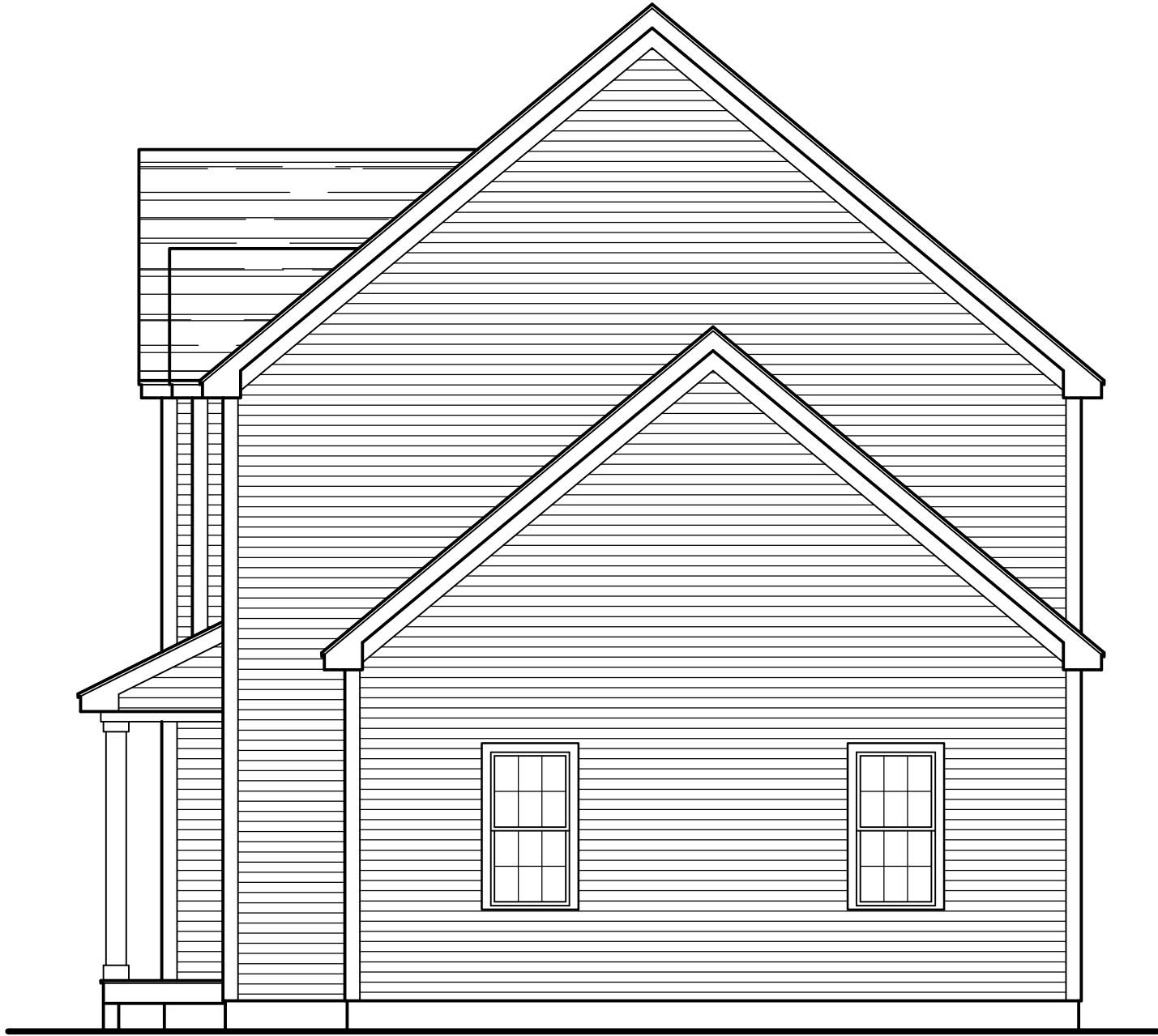
○ RIGHT ELEVATION