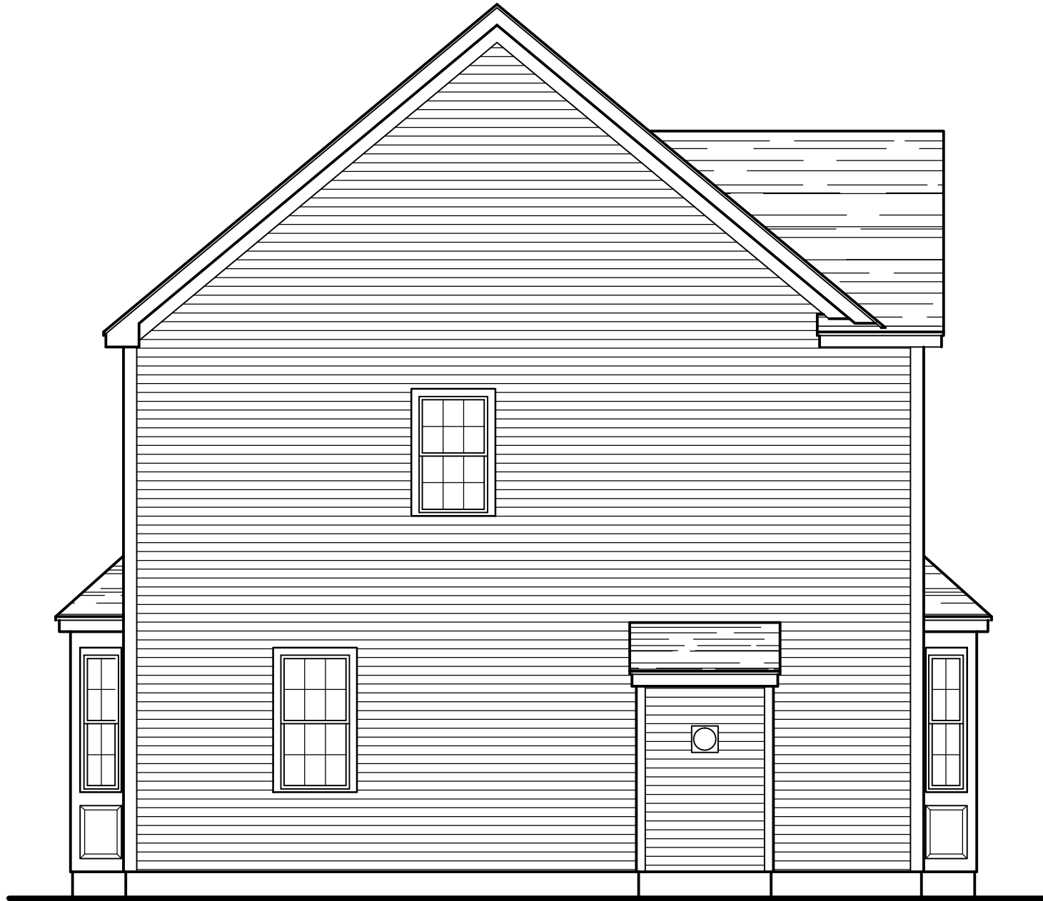
○ LEFT ELEVATION