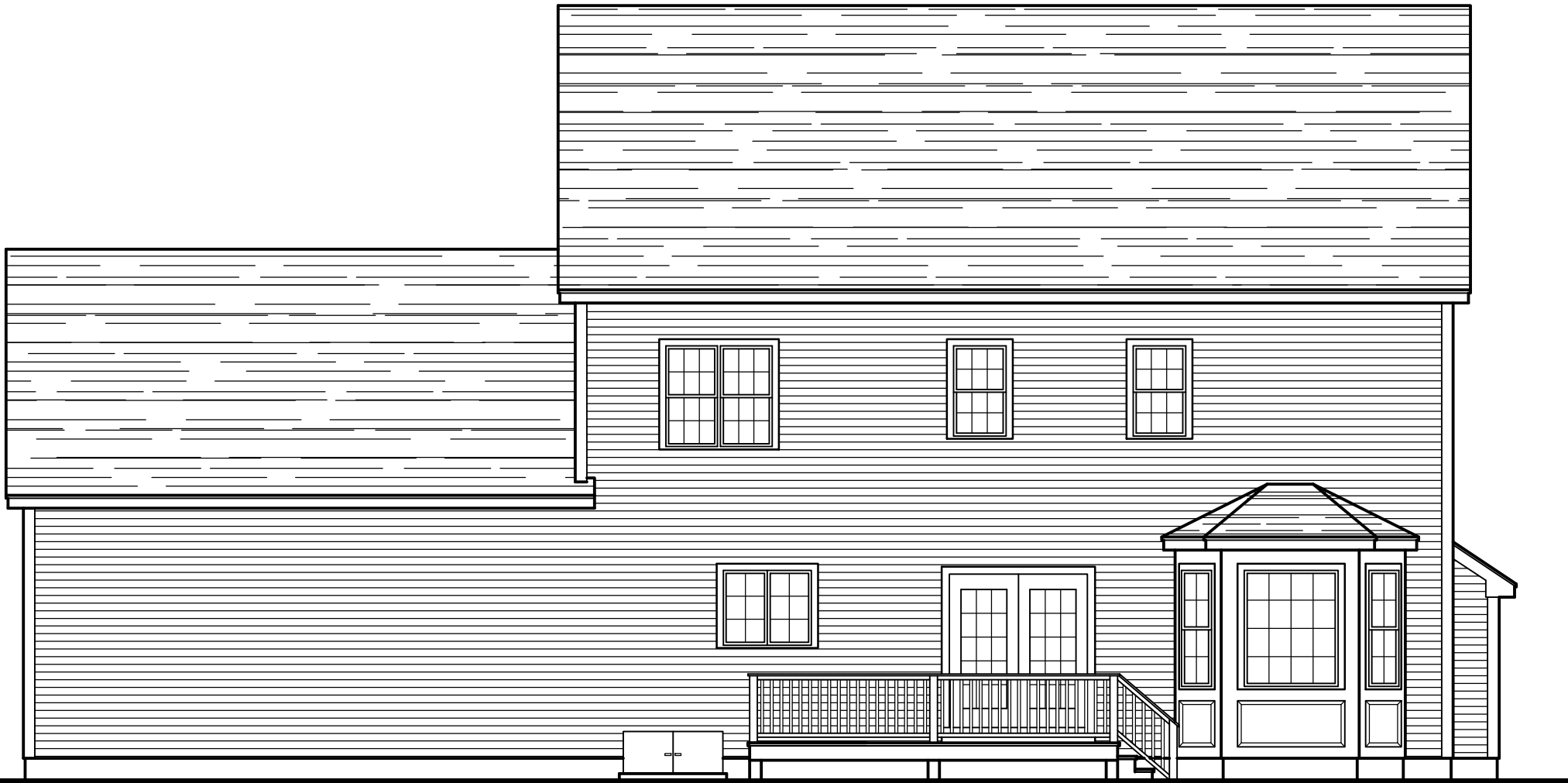
○ REAR ELEVATION